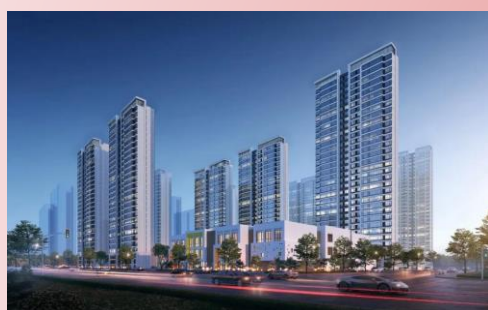
Seattle Lifestyle (Nanjing)